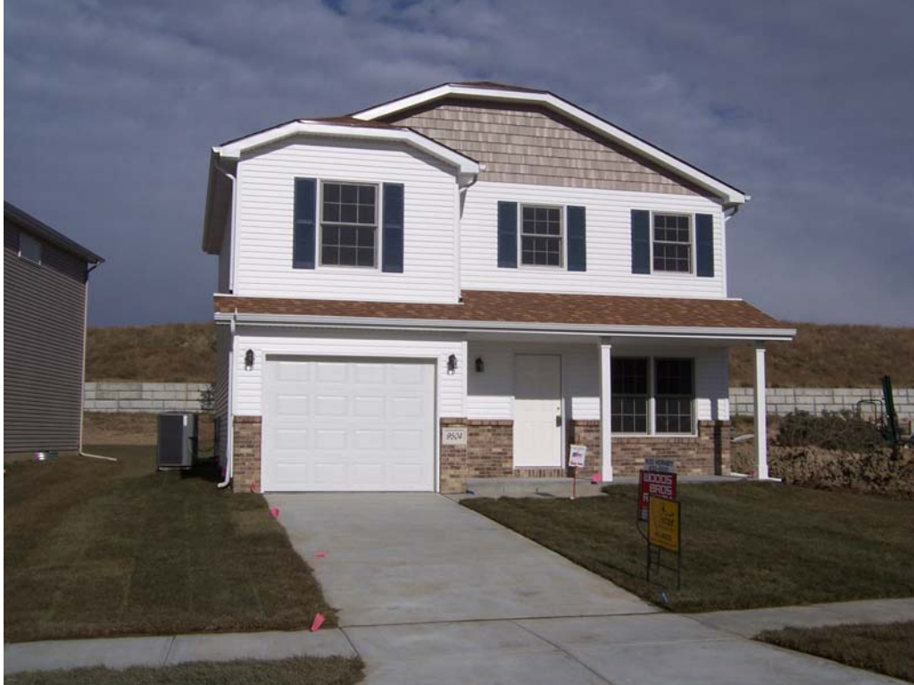
2 story—Finished living area 1600 sq. ft.