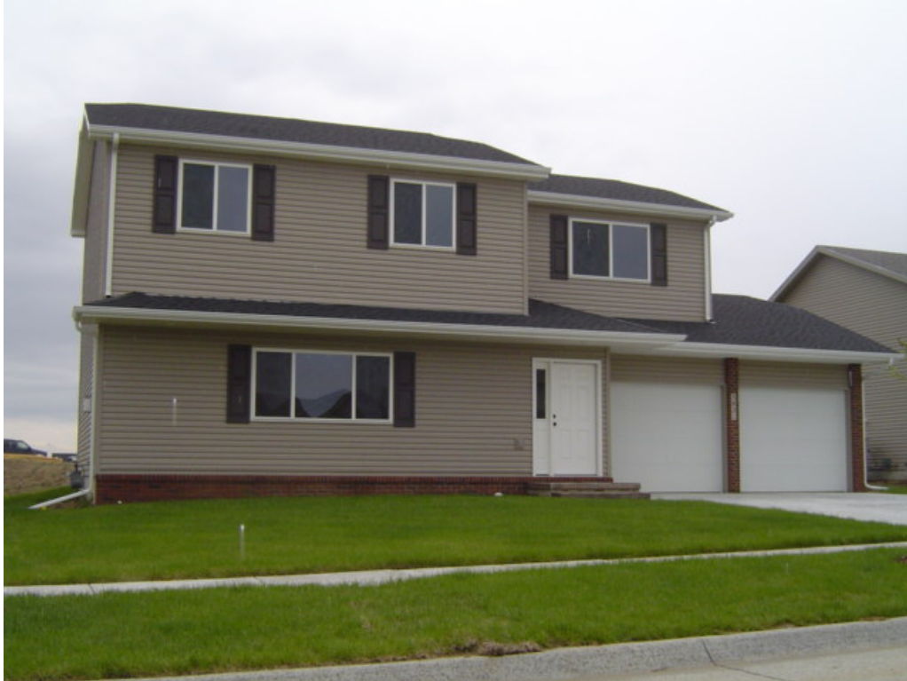
2 story—Finished living area 1635 sq. ft.