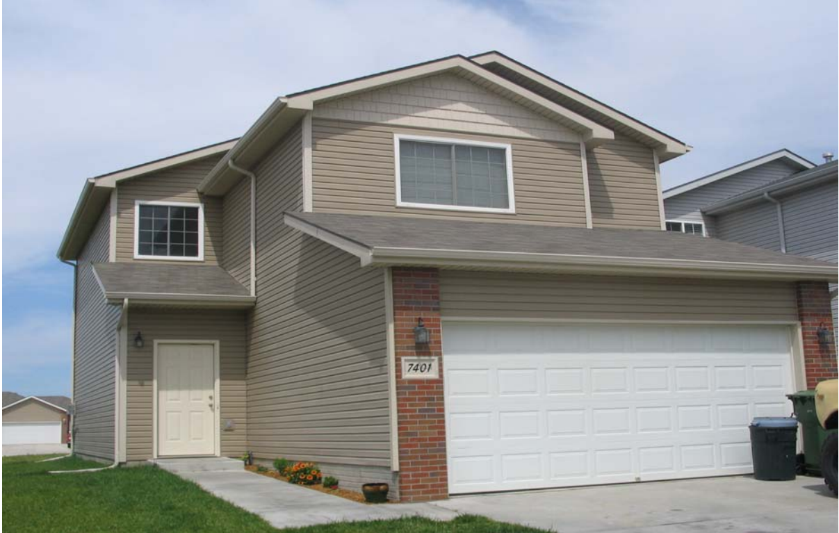
2 story—Finished living area 1635 sq. ft.