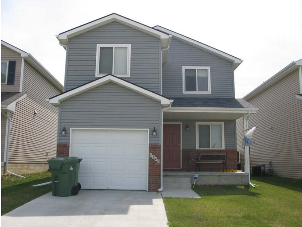
2 story—Finished living area 1572 sq. ft.